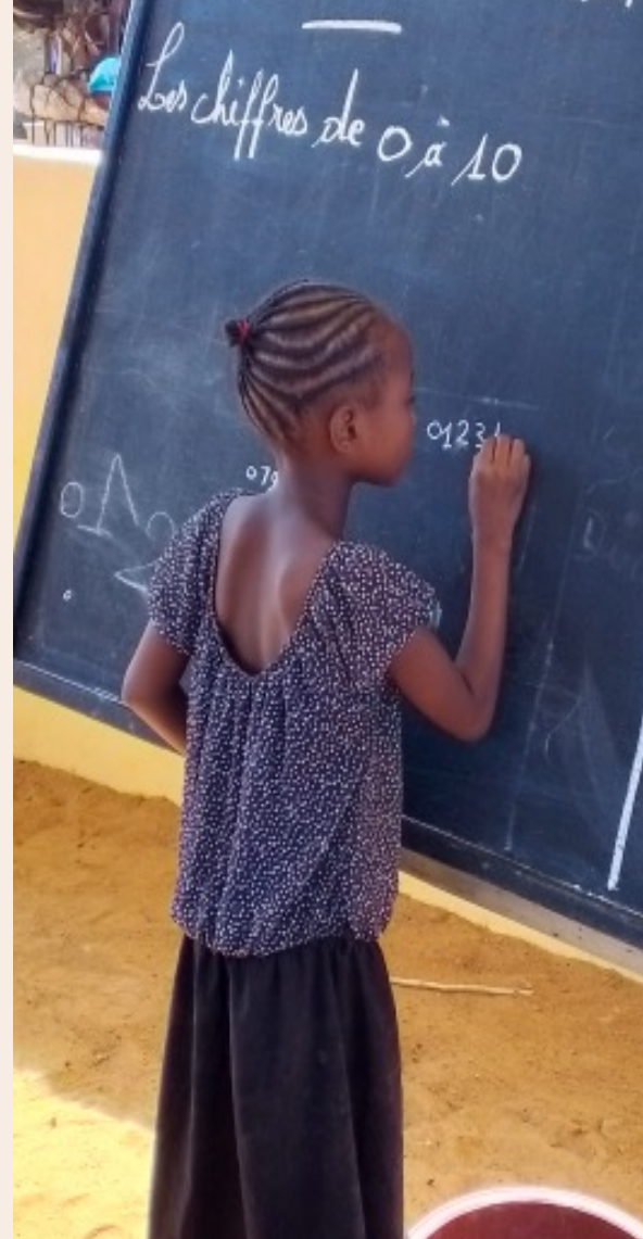
A schoolgirl learns to write on the blackboard in Erikshjälpen's project "Education for children in Ségou, San and Koulikoro" in Mali.