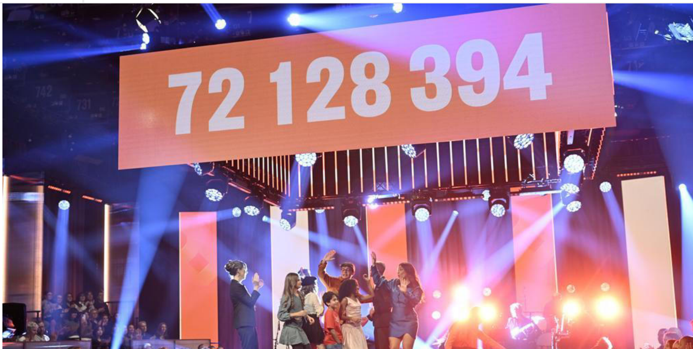
During the evening, Queen Silvia and Måns Zelmerlöw took part, among others.